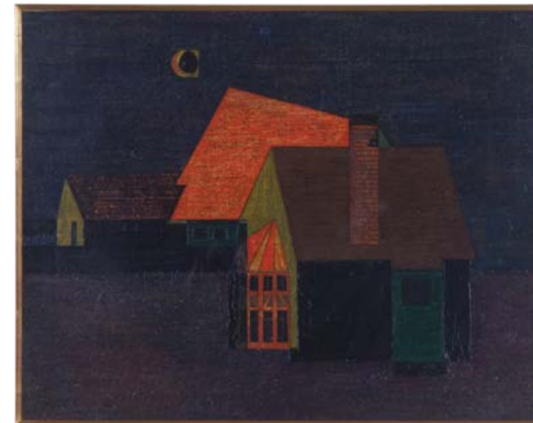
Ed Moses, Holmby Home, 1952, Crayon and tempera on board, 25 1/2 x 29 in. (64.8 x 73.7 cm)